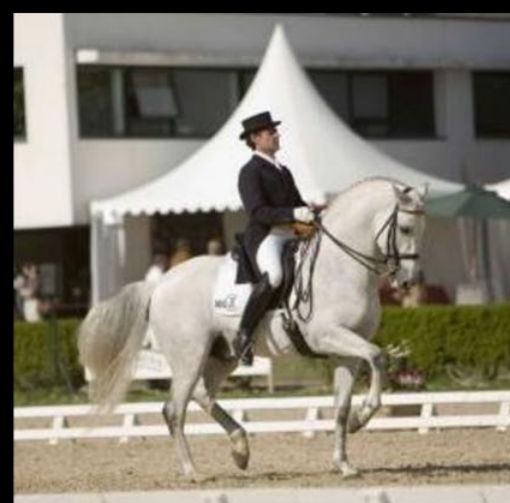
Fuego XII ~ 2008 Hong Kong Olympics