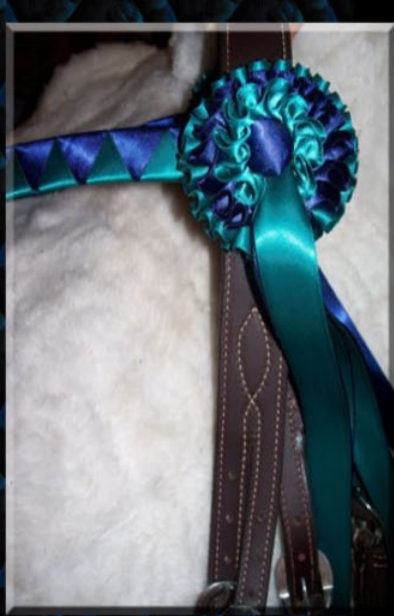
Rosette browband For halters