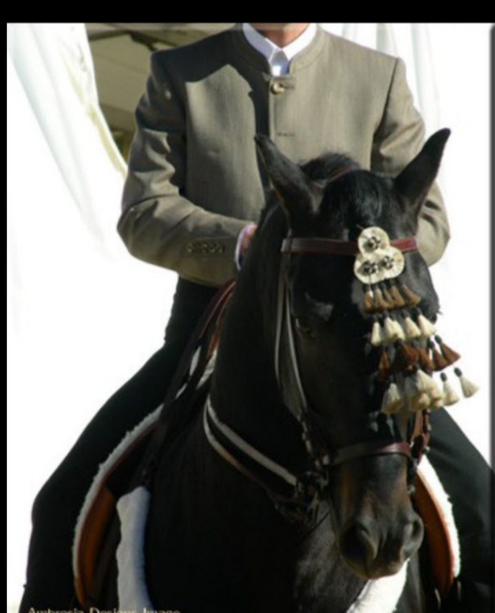
Spanish Leather Bridles with Horse hair mosquero