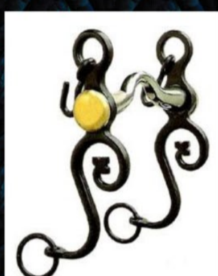
Alta Escuela bit