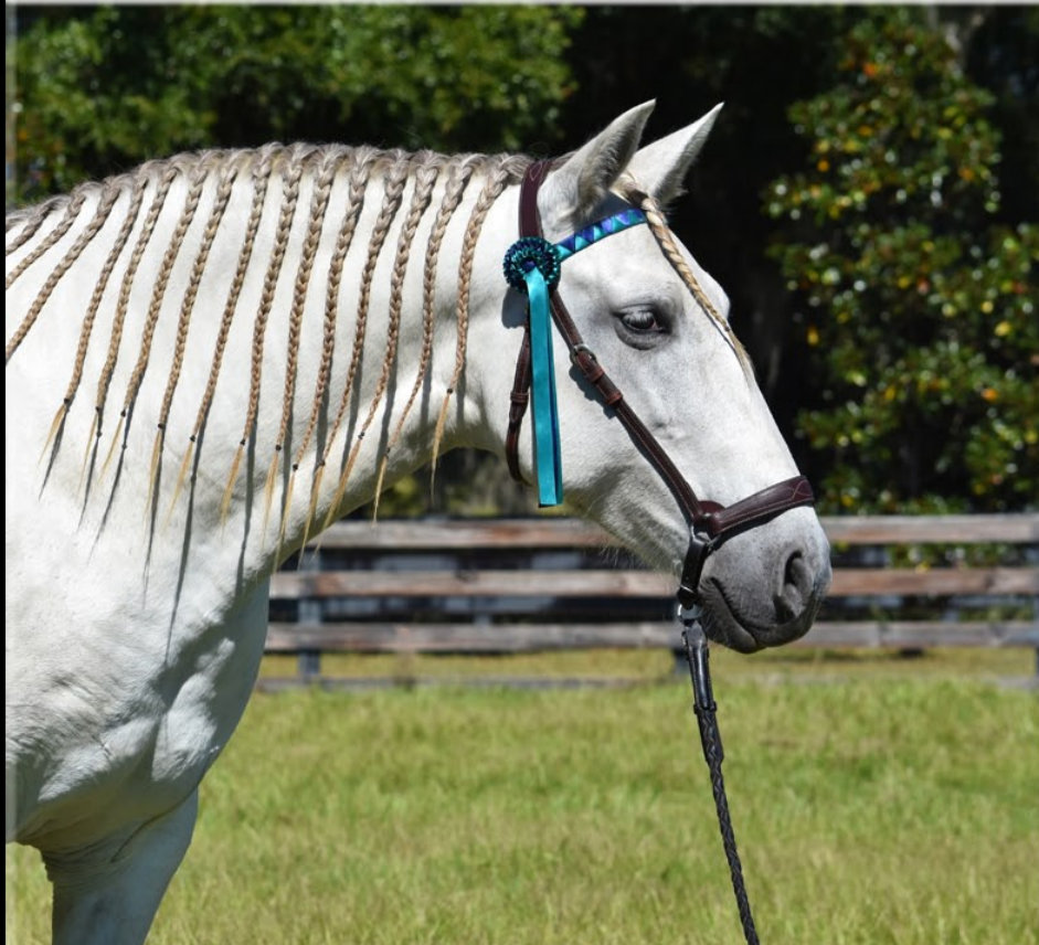
Spanish Mare Halter with rosette ribbon browband lead fastens under chin