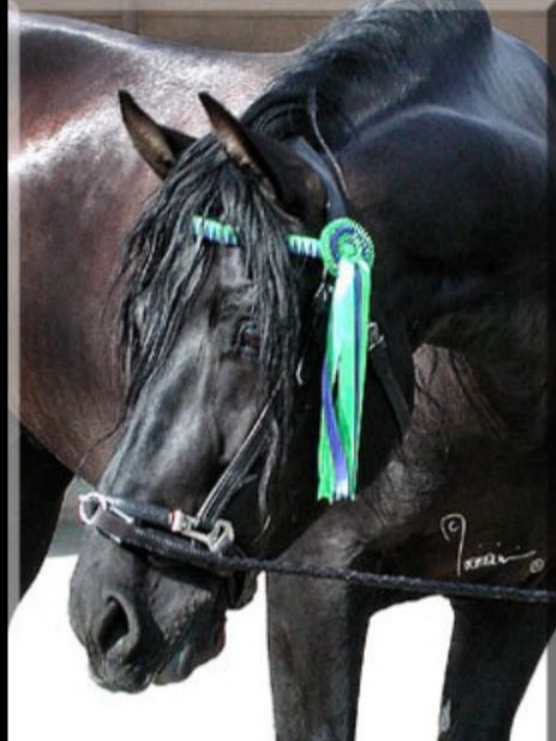
Spanish Stallion Halter with ribbon browband and seretta noseband. Lead fastens over nose band.