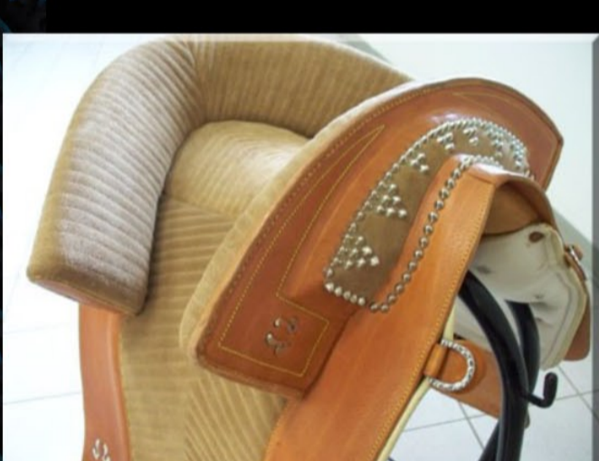
Portuguese Bullfighting Saddles