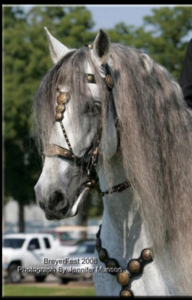
BreyerFest 2008