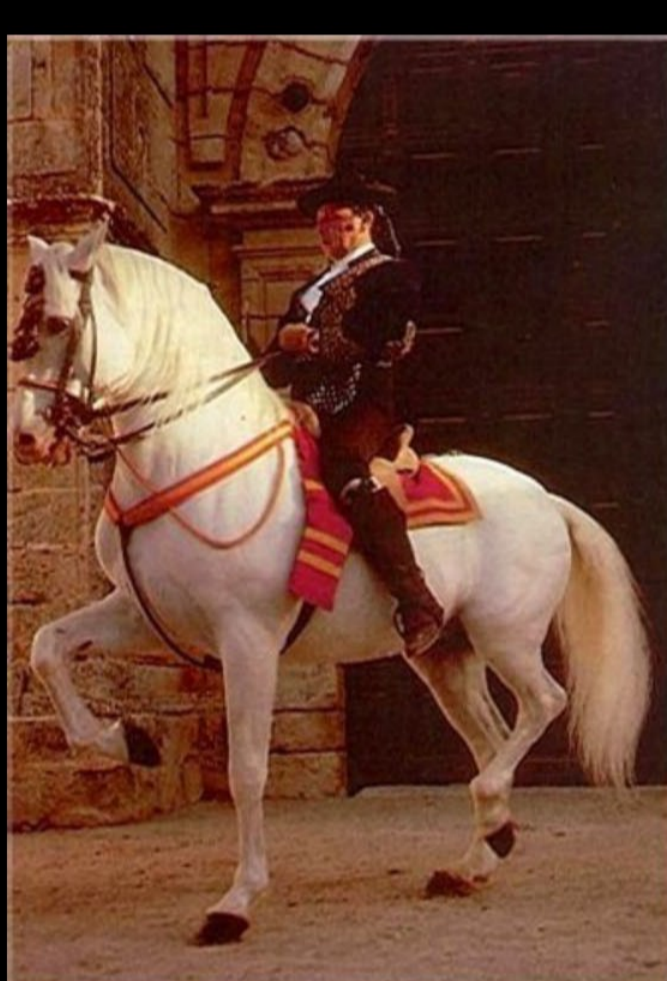
Alta Escuela Tack and attire Presented by Don Alvaro Domecq At the Royal School, Jerez