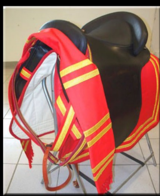
Alta Escuela Saddles are usually worn with sheepskin cover Available in suede in variety of colors