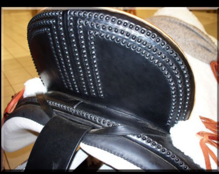
Doma Vaquera Saddle