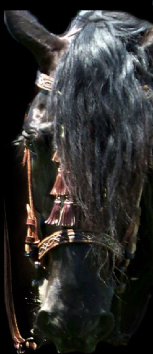
Spanish Leather Doma Vaquera Bridle with leather mosquero