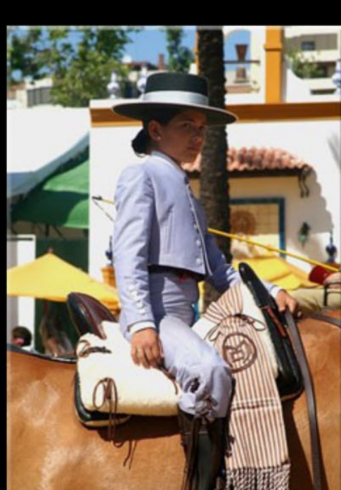
Young Riders in the Feria (fair) in Doma Vaquera attire Jerez, Spain